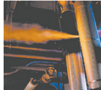
FIGURE 1 Ruptured tracing is a typical and costly steam loss.

Steam 100 psi; at $5.00 per 1000 lb. discharging to atmosphere.