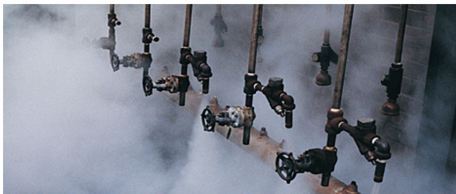
FIGURE 5 Determining trap performance by the sound method is difficult where many traps discharge in close proximity. Temperature measurement method is preferable.

There is probably a restriction in the line that is reducing the pressure to the trap.