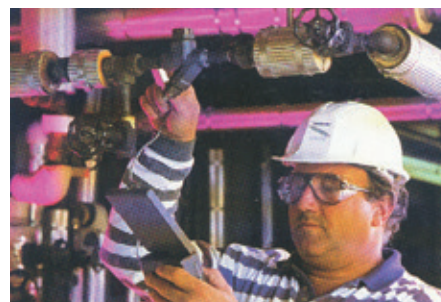
FIGURE 6 This operator is using a contact pyrometer to make upstream and downstream temperature measurements to determine trap performance in a closed condensate return system.

If we assume some typical or average conditions, we can estimate the potential energy savings based on the leaks (gaskets, pinched tubes, etc.), leaking valves (isolation and bypass) and steam traps for an installed trap population of 150.