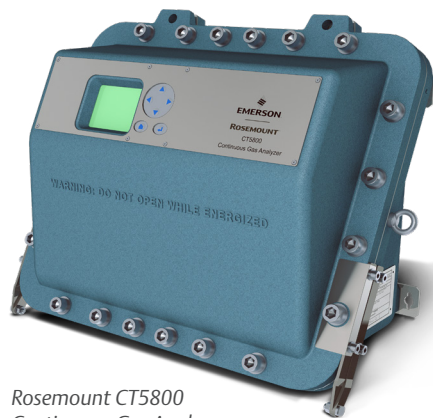
Rosemount CT5800 Continuous Gas Analyzer

*Repeatability is ±1 % of reading or the Limit of Detection (LOD), whichever is greater. Other ranges are available. Please consult an Emerson application specialist.